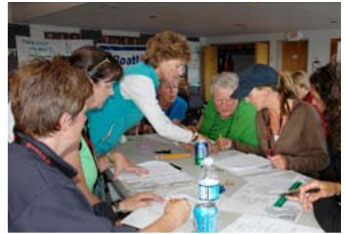
Hands-on charting is basic to understanding navigation!

dock and on the water, getting an opportunity to helm a boat, knot tying, learning crew overboard recovery procedures and generally sailing in picturesque Port Townsend Bay in 10 knot winds sur-