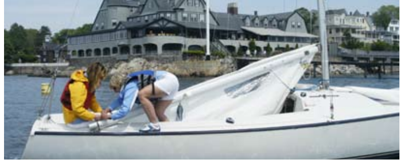
Upper: Getting the line ready to 'Heave Ho'! Above: Lending a hand rigging an unfamiliar boat