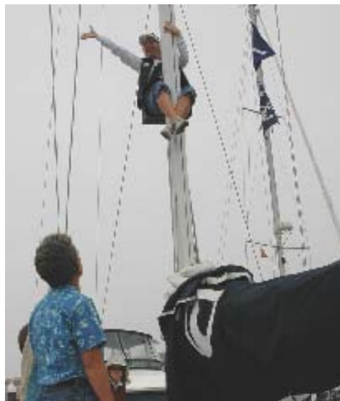
"Going Up the Mast" Workshop