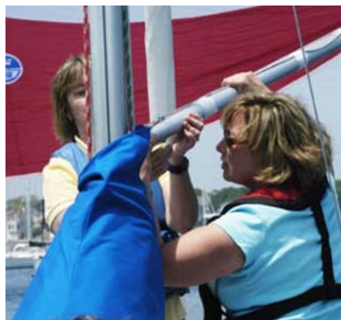
Attaching the spinnaker pole to the mast.

Parts Company, MASS BAY SAILING, National Grand Bank and North Sails.