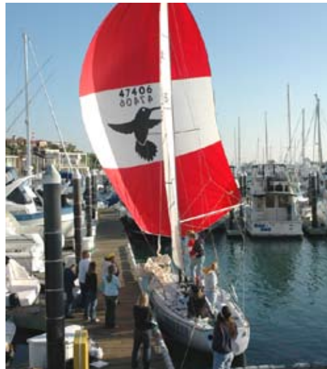
Spinnaker Rigging Workshop