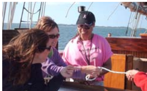
"I think the rabbit goes around the tree."

By 9 p.m., we were all in our bunks waiting for the hurricane to arrive, the gentle rocking of the ship lulling us to sleep.