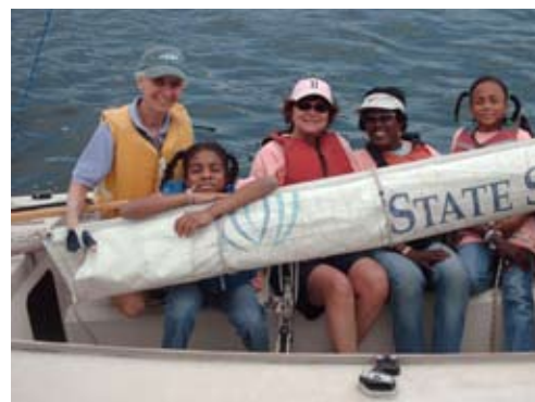
Lots of smiles at the Boston AdventureSail® event!