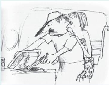
Ice Chest: Routine Maintenance

Ice Chest — Insulated compartment in the galley that holds a block or two of ice to keep food and beverages cool. No one knows why—it could have something to do with sudden temperature changes, continuous sea motion, and pressure—but fresh produce placed inside undergoes a transformation into a dense, pear-like substance surprisingly similar to soft coal; frozen meat corrodes; and containers of beer are somehow transmuted into cans of diet Fanta.