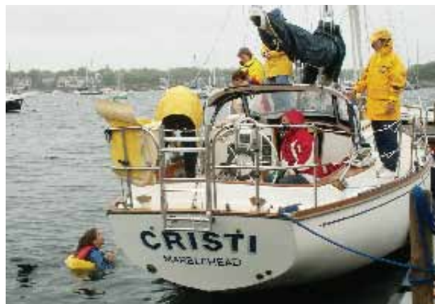
Man over board workshop despite strong winds & rain!