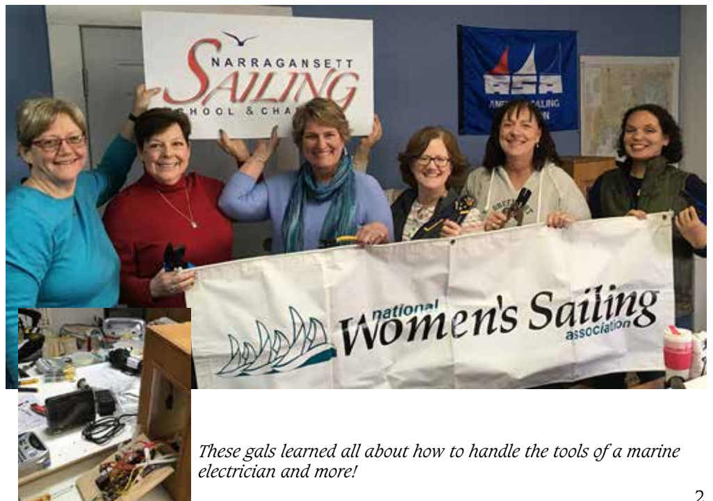
These gals learned all about how to handle the tools of a marine electrician and more!

The fourth year of this two-day hands-on workshop was held at Narragansett Sailing School in Barrington, Rhode Island. Participants spent day one learning wiring skills, working on an electrical budget for a fictional 35 foot boat, and using a variety of tools that were a cut above the usual tools boatowners know about. A side trip to another building gave all a chance to see the inner workings of an Edson steering pedestal, and a rudder and rudder post assembly. A (brand new!) manual head was disassembled to show the joker valve and how to replace it. On the second day, the group wired an AIS transponder, chartplotter, water pump, bilge pump and cabin light to power, using appropriate fuses and circuit breakers. They plumbed both pumps and ran them, with the water from the freshwater pump filling the "bilge" and being pumped by the bilge pump into the water tank. Remarkably, no one got wet.